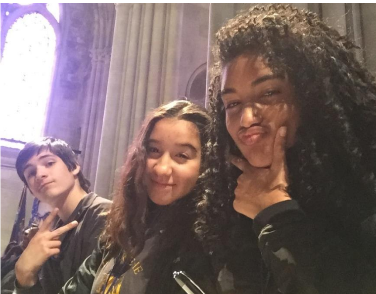
Our Youth delegates at Diocesan Convention.