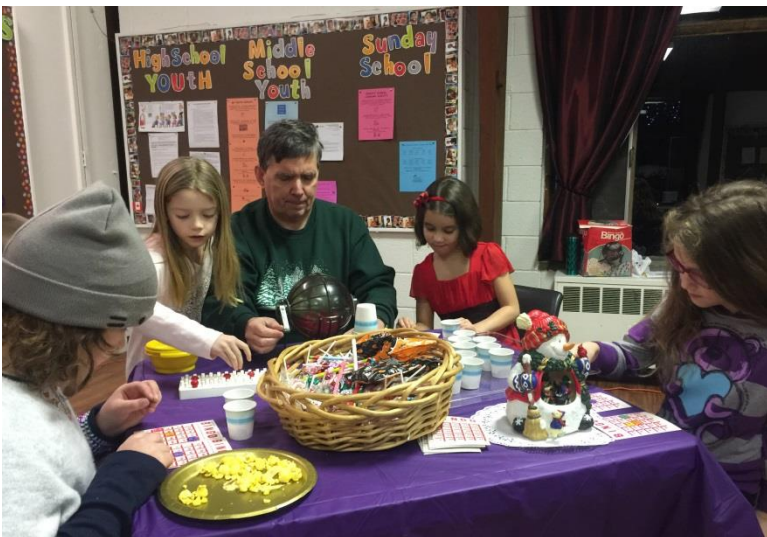
Bingo at our Twelfth Night Celebration