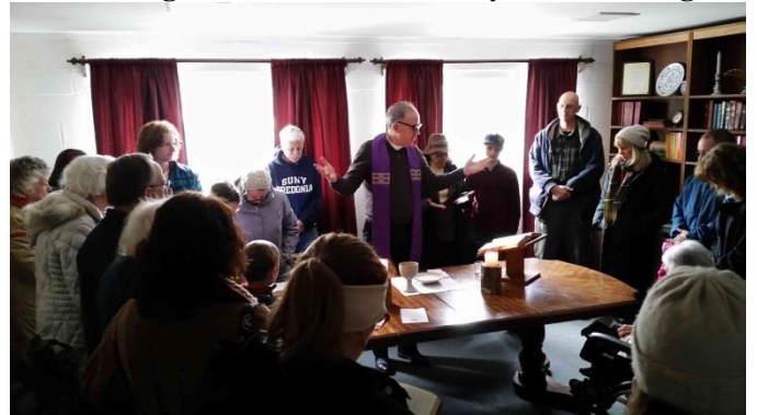
Beautiful Eucharist in the Guild Room