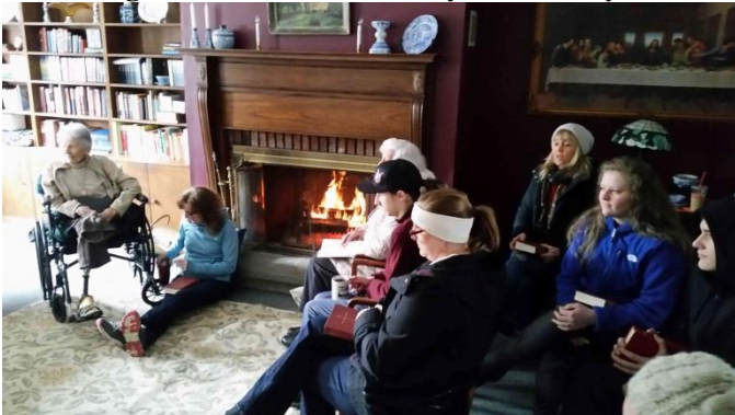
Having no heat couldn't stop us from having church!