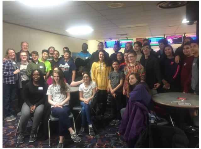
Interfaith Youth Bowling