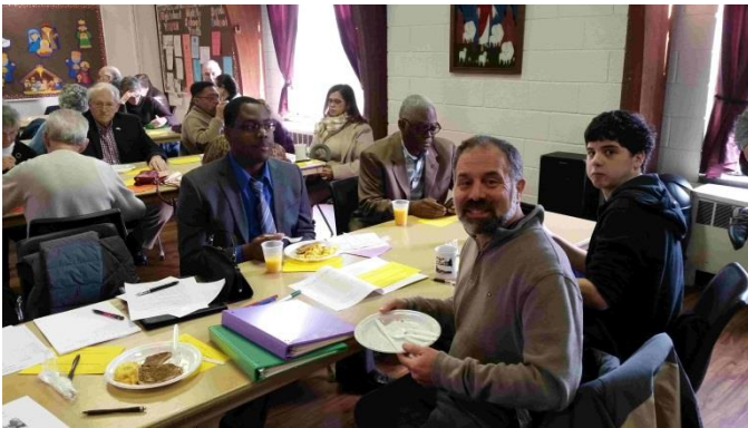
Fun and food at the Annual Meeting