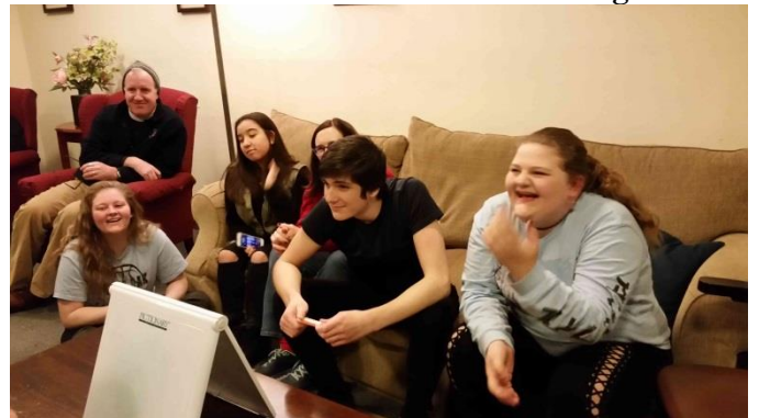
Game Night – the Youth are ready for a challenge!