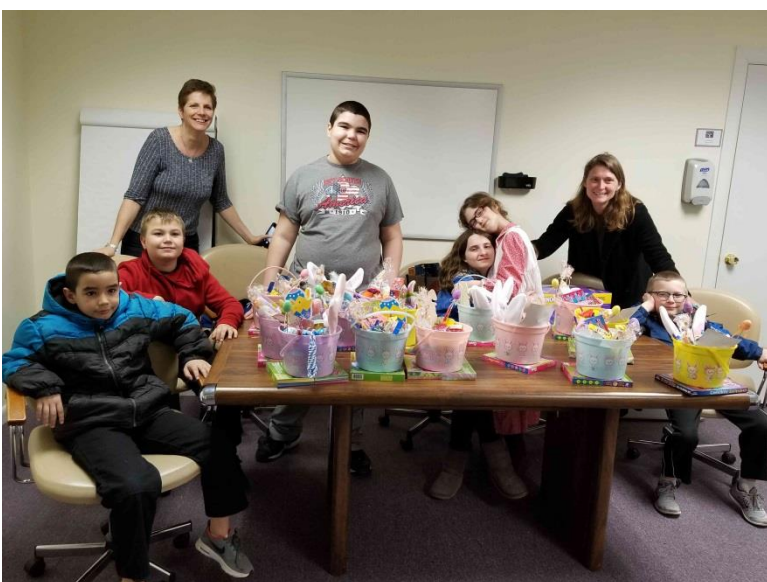
Delivering Easter Baskets to PNWWRC